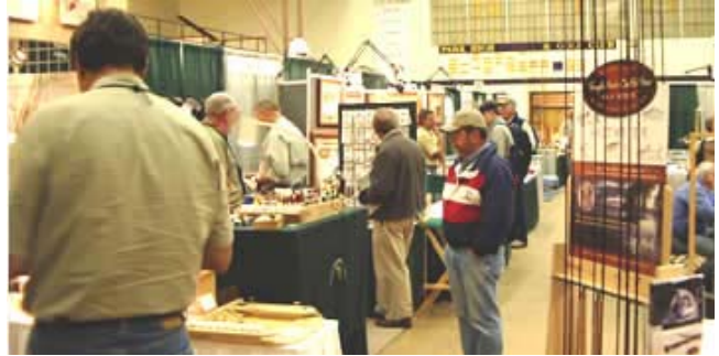
A WSCFFF Board member checking the goodies.