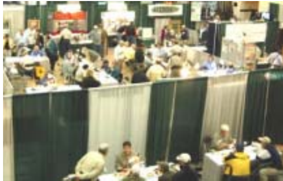
Another view of the display floor.