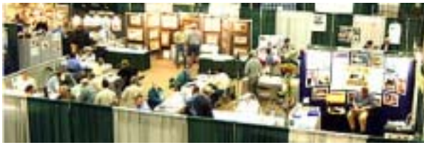
Display floor with vendors and fly tiers arranged together.