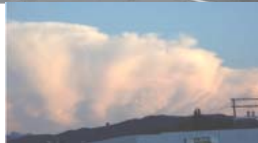
Wine and Cheese party gives you a chance to meet many people like “Van” Gytenbeek talking to Leslea Dennis (right side of picture) A “Fish Walk” closed Main St, shops opened and people danced. Good thing the storm stayed south of town